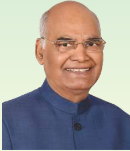
Shri Ram Nath Kovind